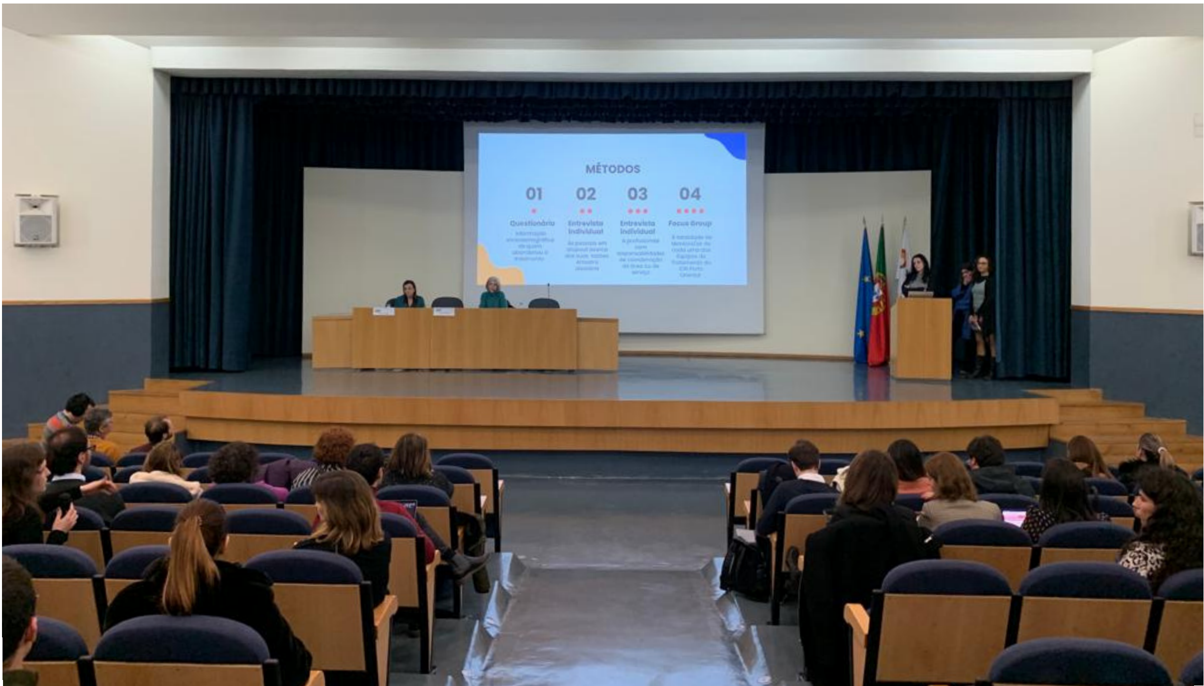
MAGALHÃES LEMOS HOSPITAL AUDITORIUM - MARCH 6, 2023