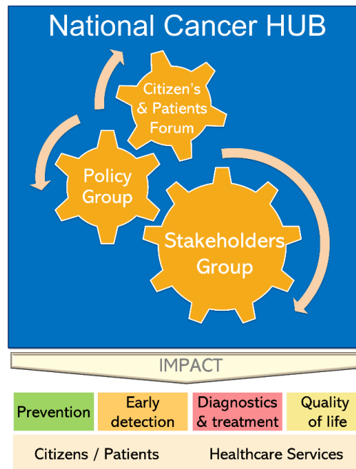
Fig.1 – Portuguese National Cancer Hub overview, governance structure and impact